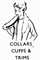
COLLARS, CUFFS & TRIMS

"Velcro" touch and close fastener (a Swiss invention) is made of two Bri-nylon strips which grip firmly at a touch, yet easily peel apart. "Velcro" can be cut with scissors to any length. You can sew it on by hand or machine. It can be washed and dry-cleaned. Cannot jam or rust.