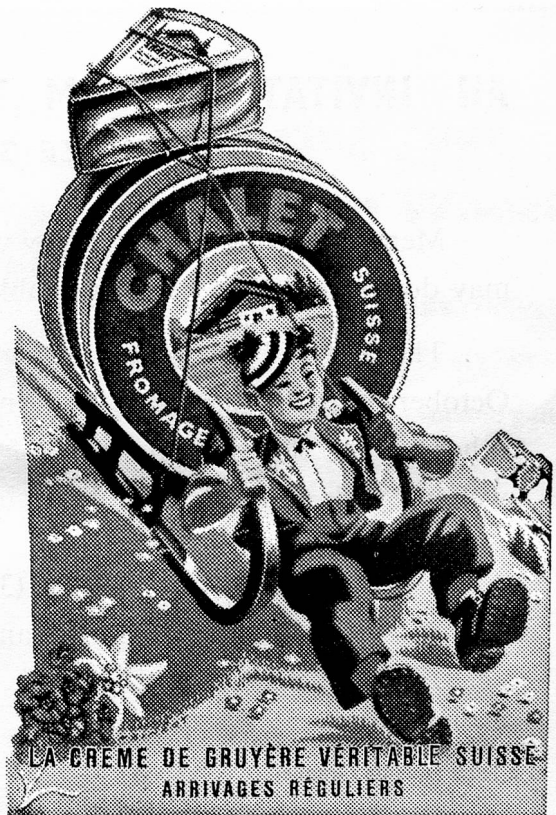
Swiss Chalet Cheese is a real treat for Cheese lovers

draw the attention of merchants, forwarding agents and firms connected with Switzerland engaged in the import and export trades to the fact that the SCHWEIZ ALLGEMEINE VERSICHERUNGS-AKTIEN-GESELLSCHAFT, Zurich, have a British subsidiary company the Switzerland General Insurance Co. (London) Ltd. , offering the facilities of a first class British insurance company backed by the Swiss company and a world-wide agency organisation. Insurances can be effected at very competitive rates with personal service and advice given where required. We have special facilities for arranging insurances with this company and welcome enquiries.