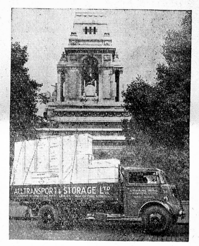
Traffic to and from all parts of the World

Official Passenger Agents for all Principal Steamship Companies - Official Freight & Passenger Agents for all Air Lines