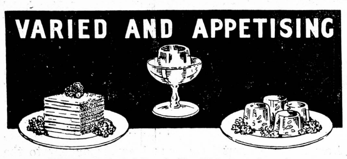
With Maggis Aspic Jelly valuable additions may be made to war-time menus. From meat, fish and vegetable "left-overs" attractive supplementary dishes can be contrived.

Switzerland is the only country in Europe and Geneva the only town in Switzerland where one can get any kind of drink one desires. Tobacconists are piled high with cigarettes of every brand and the