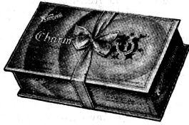
"CHARM" ½lb 2/- 1lb 4/-