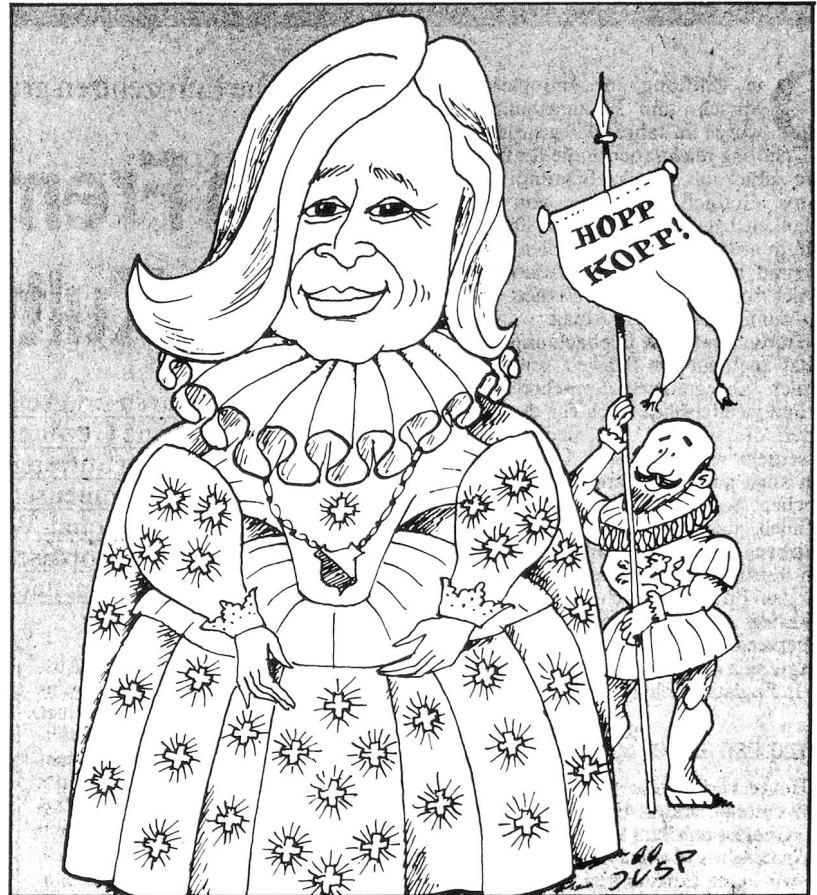
Switzerland's Queen Elisabeth

But he and his wife rejected allegations against him as groundless – and Mrs Kopp said she believed the attacks may even have swung sympathy votes in her favour.