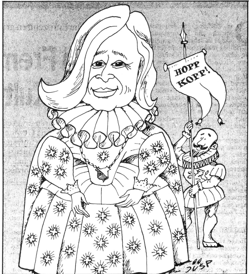
Switzerland's Queen Elisabeth

But he and his wife rejected allegations against him as groundless – and Mrs Kopp said she believed the attacks may even have swung sympathy votes in her favour.