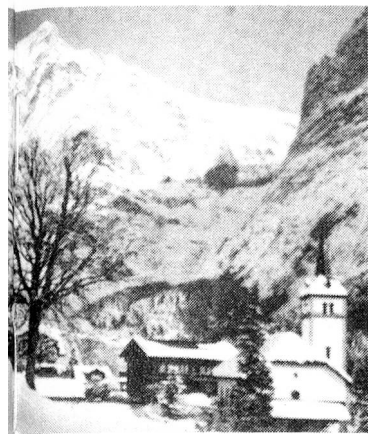
berns mastering tourist development, in contrast to the picturesque tourist in the Bernese Oberland (above right)