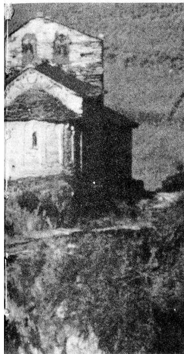
by attraction for tourists