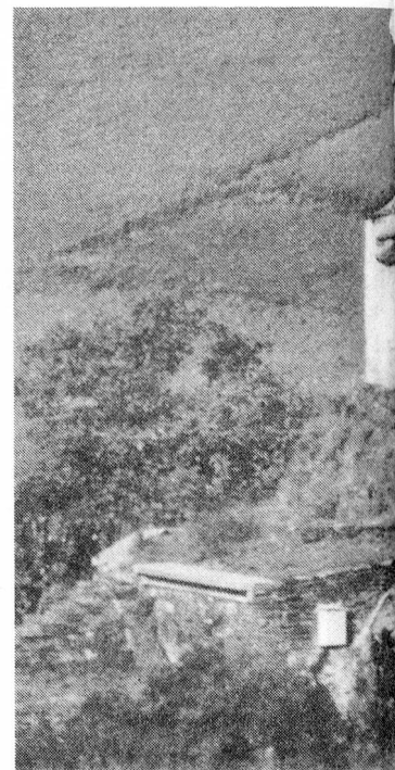
Andorra's idyllic scenery could be a

FROM Ax-les-Thermes in the French Pyrenees to Seu de Urgel in the Spanish province of Catalonia is just 90 kilometres along the route nationale. Yet the trip often takes all day, for on the way lies Andorra: 464 square kilometres, six parishes, 40,000 souls (though during shopping hours there are far more).