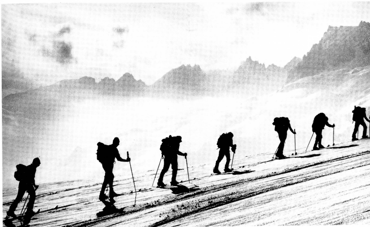
The group follows an experienced leader – usually a mountain guide