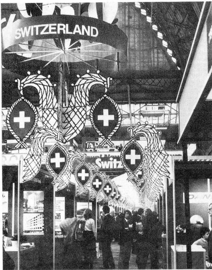
Part of the Swiss Avenue – at the World Travel Market