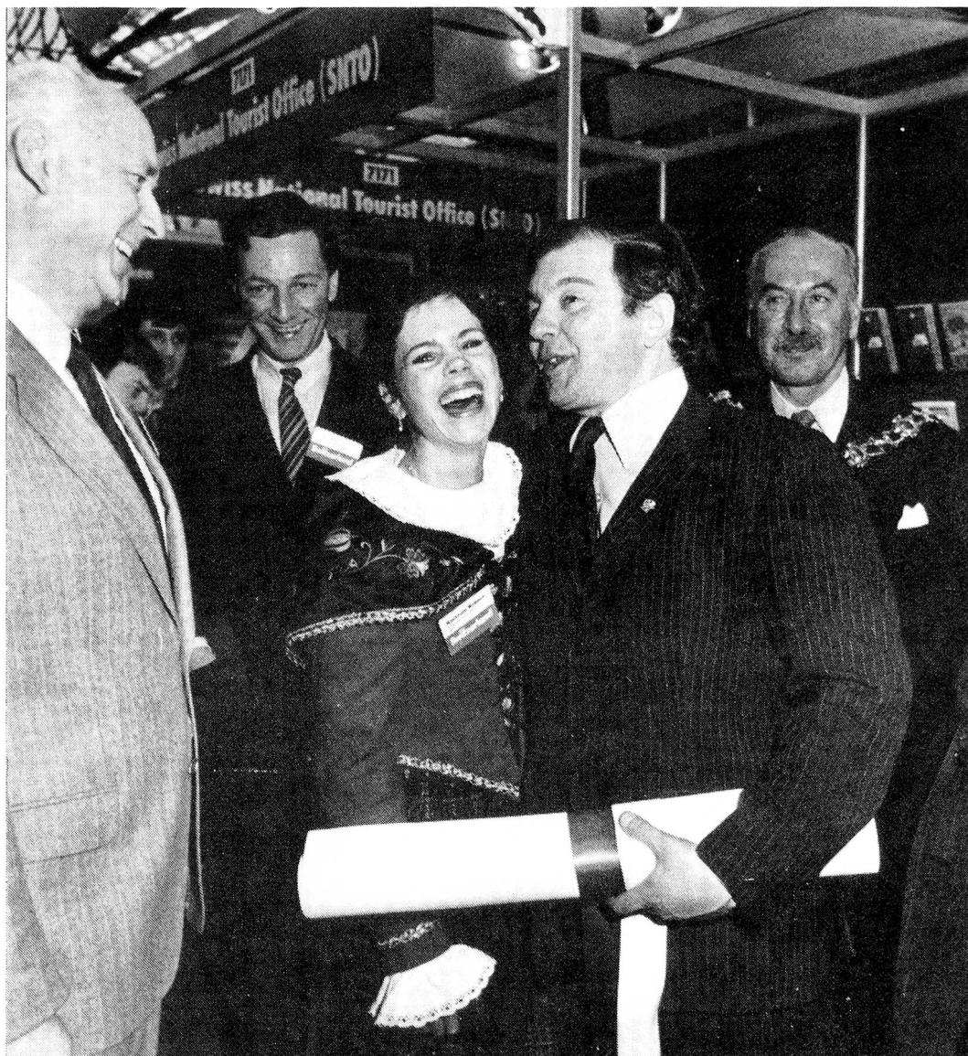
Lord Lyell shows his delight at receiving the children's holiday voucher on behalf of the Swiss National Tourist Office. Also in picture are Mr Leu of the SNTTO, Zurich; the Lord Mayor of Kensington and Minister Caratsch of the Swiss Embassy.

The Swiss National Tourist Office does not only promote holidays, but also congresses and conventions. There has been a great increase in these. The