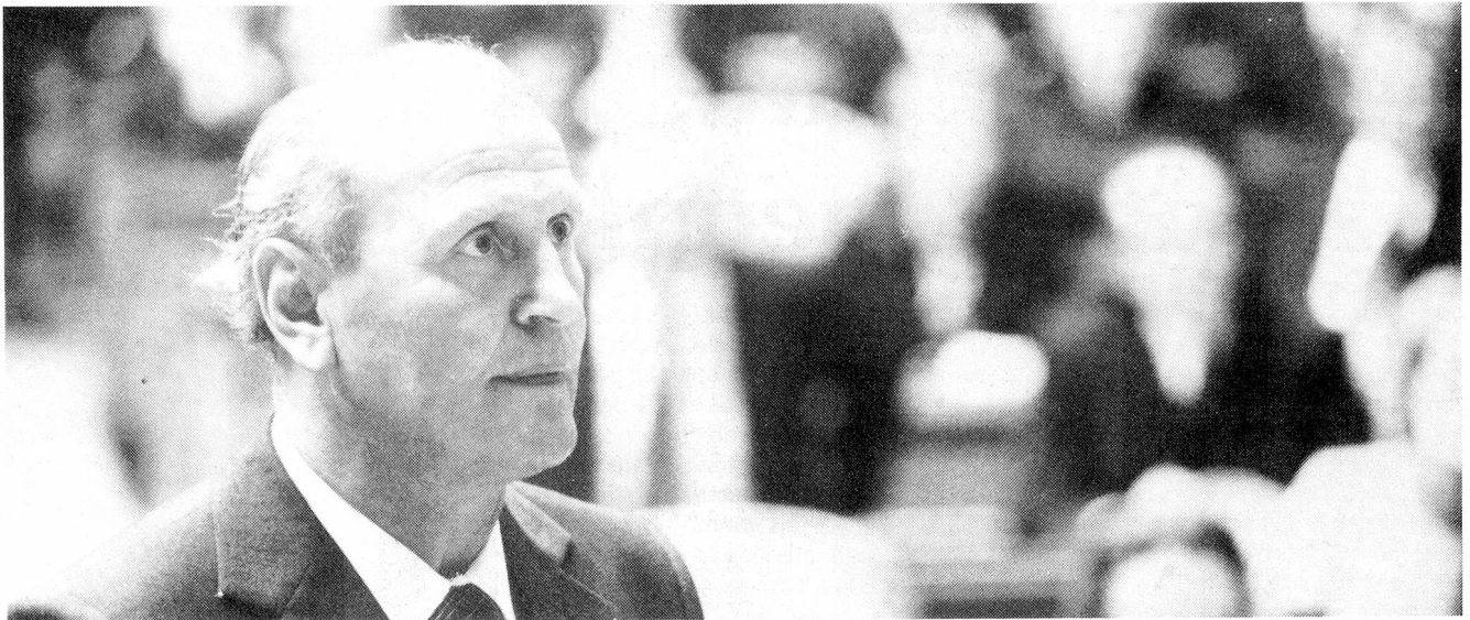
The late Willi Ritschard