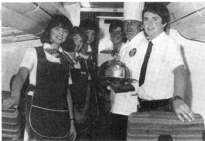
Dan-Air at your service – grouse at 33,000 feet

Shortly before half past six the estate car with 6½ brace drove up to a great cheer by an appreciative crowd. The executive chef saw to a brace or two of birds being plucked and cooked in record time and taken by car to Inverness Airport. Not much of a speed limit – the plane had to be caught.