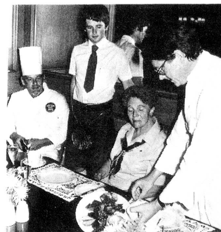
Second breakfast at the Inn on the Park