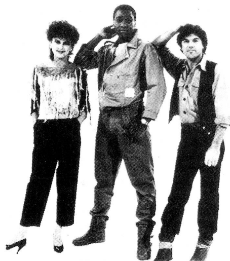
The BBC took two awards with its "Three of a Kind" comedy show

"Another is to provide the assembled delegates with complete texts, which distracts from what's happening on the screen. The third and most effective side is subtitles".