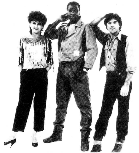
The BBC took two awards with its "Three of a Kind" comedy show

"Another is to provide the assembled delegates with complete texts, which distracts from what's happening on the screen. The third and most effective side is subtitles".