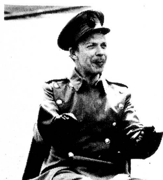
Brian Murphy in Thames TV's "It's Your Move", winner of the prize for the festival's funniest programme