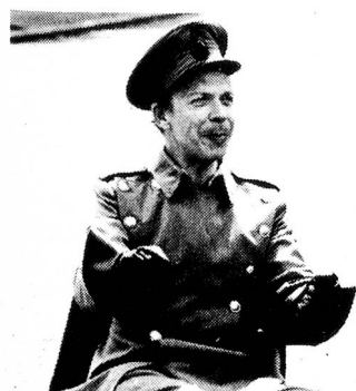
Brian Murphy in Thames TV's "It's Your Move", winner of the prize for the festival's funniest programme