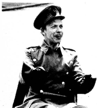
Brian Murphy in Thames TV's "It's Your Move", winner of the prize for the festival's funniest programme