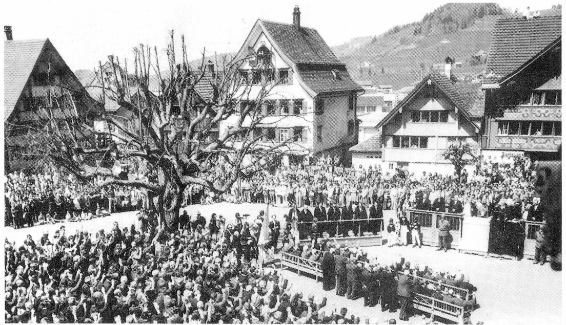
The annual open-air assembly in Appenzell-Innerrhoden