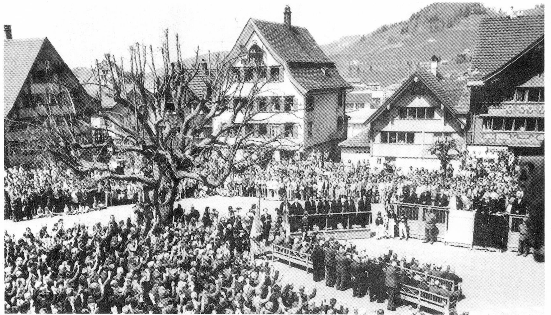
The annual open-air assembly in Appenzell-Innerrhoden