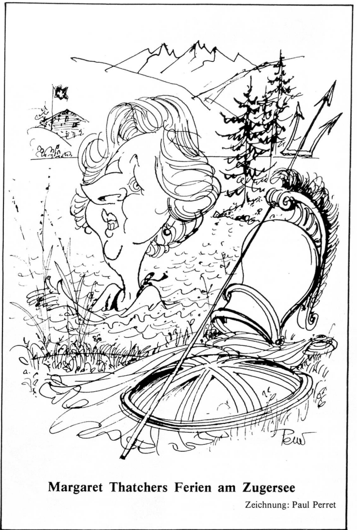
Margaret Thatchers Ferien am Zugersee