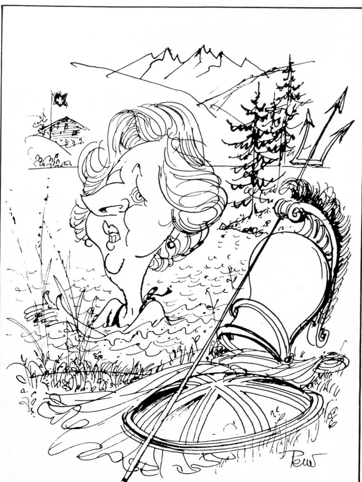
Margaret Thatchers Ferien am Zugersee