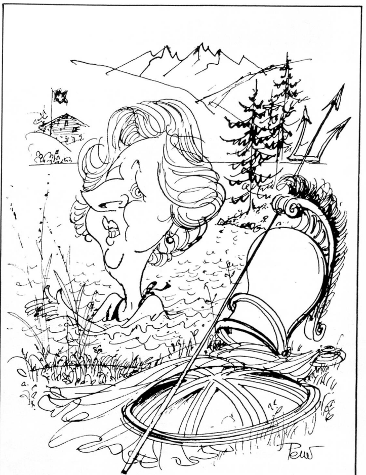
Margaret Thatchers Ferien am Zugersee