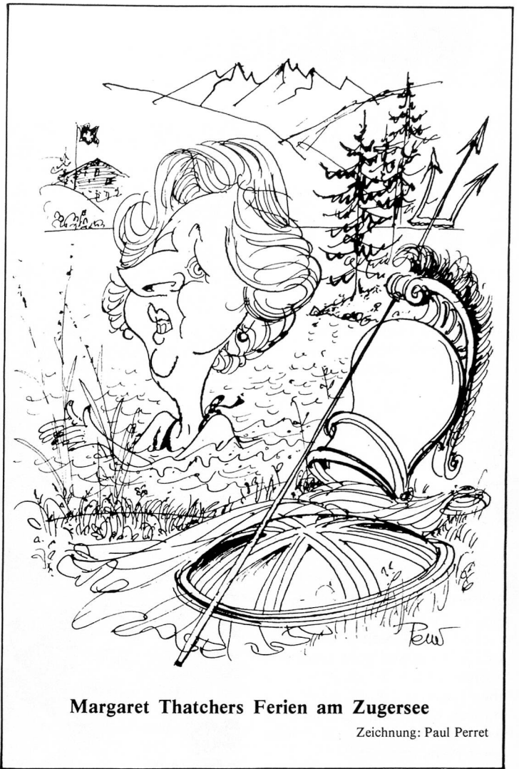
Margaret Thatchers Ferien am Zugensee