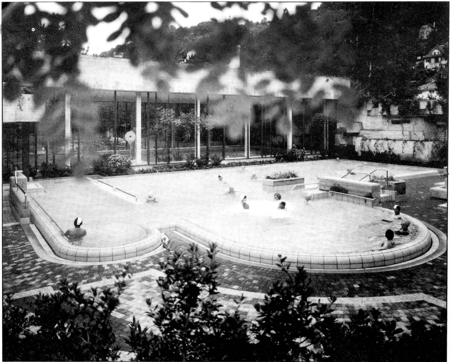
The modern open air thermal pool in Baden

The springs were opened in 1955 and have since been expanded. Special "Badezüge" get day bathers from Zurich there and back.