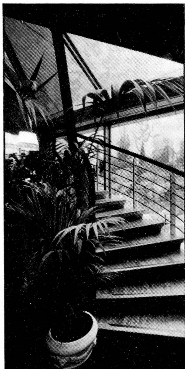
Interior views of the Nova-Park