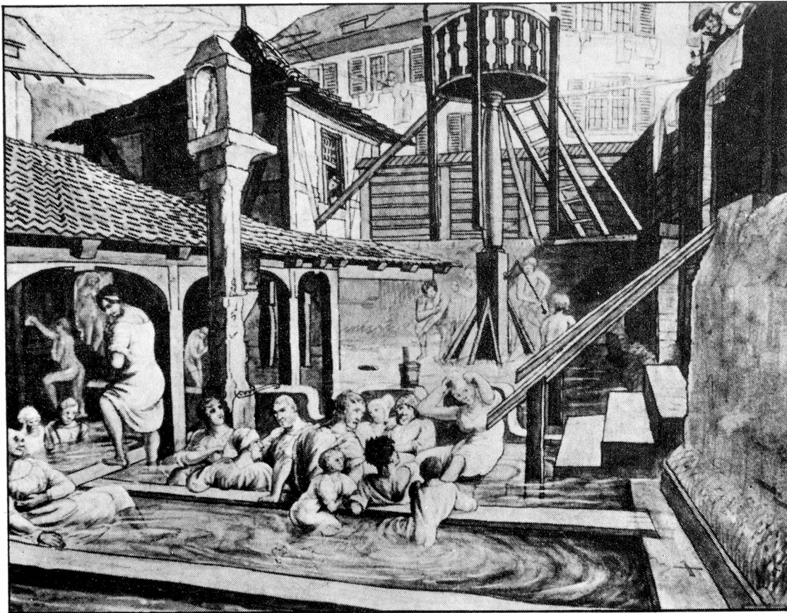
The "Verena Bath" in Baden, 1815