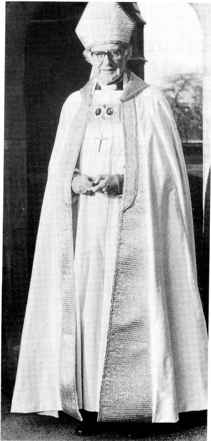
Swiss visit for Archbishop Runcie:

He will open the festival with a piano recital on Sunday, August 8 and will also be involved in lectures and master classes. He will concentrate during the festival on the late works of Liszt.