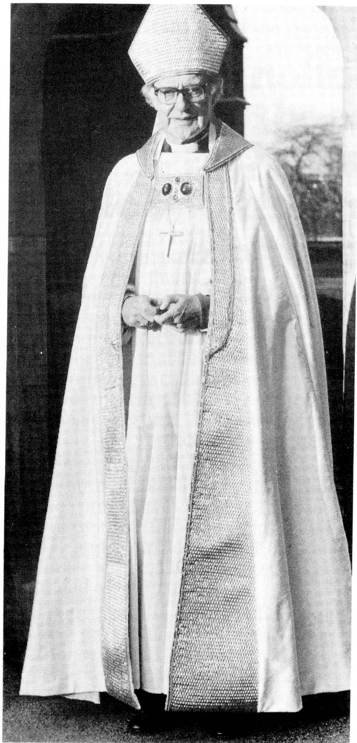
Swiss visit for Archbishop Runcie:

He will open the festival with a piano recital on Sunday, August 8 and will also be involved in lectures and master classes. He will concentrate during the festival on the late works of Liszt.