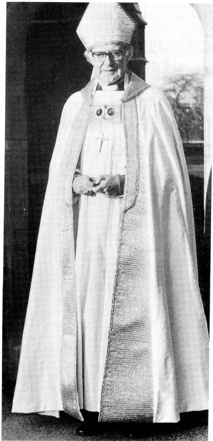
Swiss visit for Archbishop Runcie:

He will open the festival with a piano recital on Sunday, August 8 and will also be involved in lectures and master classes. He will concentrate during the festival on the late works of Liszt.