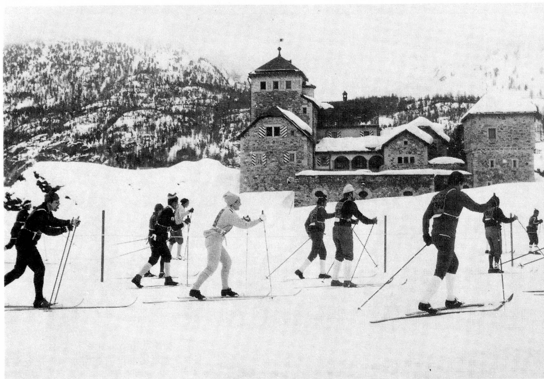
Some of the skiers in the 35-mile marathon near the Castle Crap da Sass in Silvaplana/Grisons.