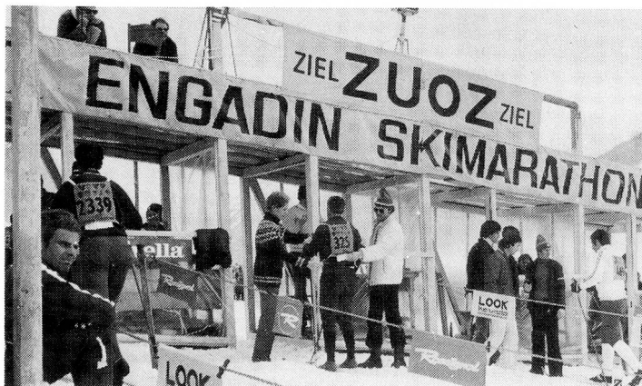
Most marathon entrants ski for more than three hours before they cross the finishing line.

An all-inclusive arrangement from March 7 to 15 (eight nights), combining scheduled air travel to Basle, rail transfer, half board at the two-star Hotel Scaletta at S-chanf near Zuoz, tuition and training, as well as the entry fee for the marathon, is available from £245.