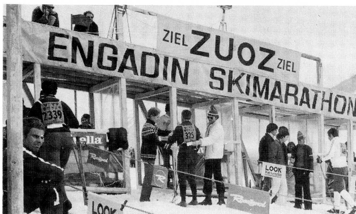
Most marathon entrants ski for more than three hours before they cross the finishing line.

An all-inclusive arrangement from March 7 to 15 (eight nights), combining scheduled air travel to Basle, rail transfer, half board at the two-star Hotel Scaletta at S-chanf near Zuoz, tuition and training, as well as the entry fee for the marathon, is available from £245.