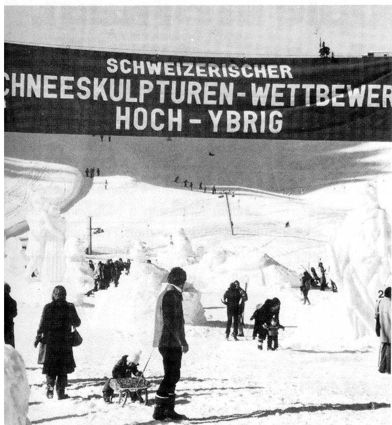
Amateurs and professionals compete in this annual contest in Central Switzerland.