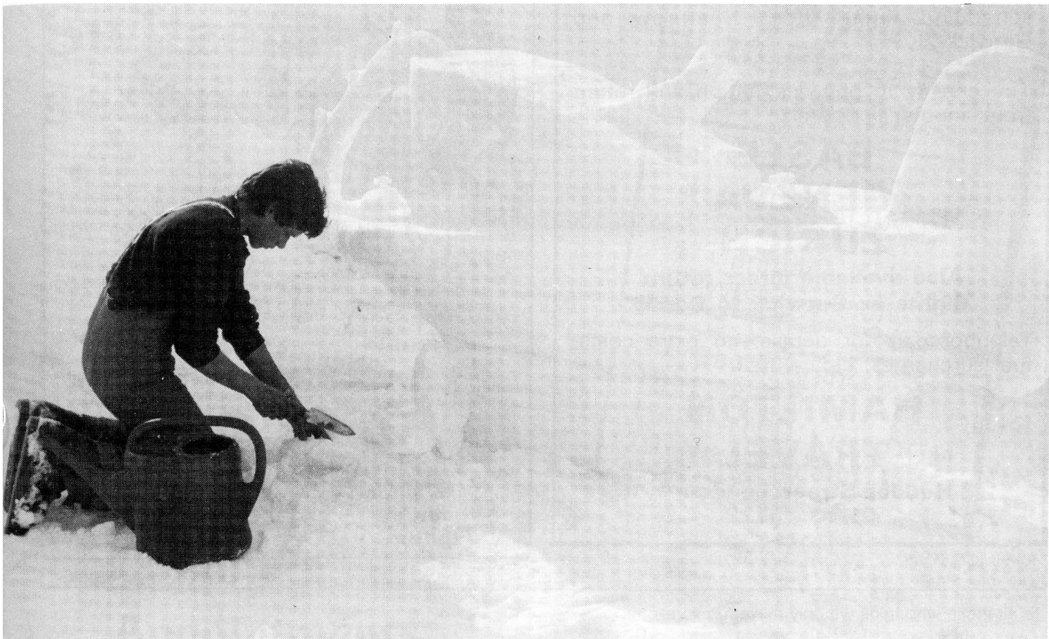
ry in the snow at one of Hoch-Ybrig's past competitions.