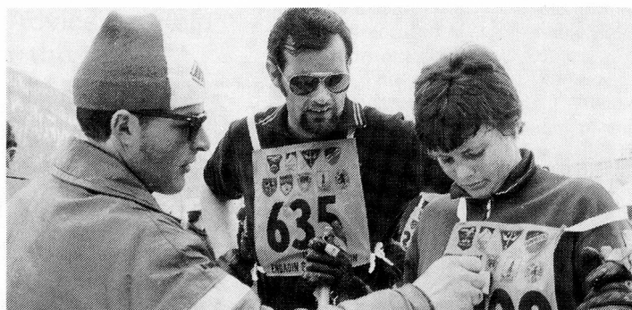
The words "Finished the Course" are stamped on the starting numbers – a perfect souvenir for the living room wall.