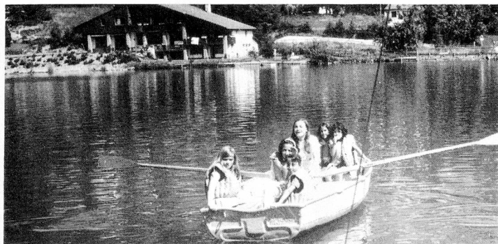
Swiss schools provide an opportunity for tourism

provide a general education along with vocational training.