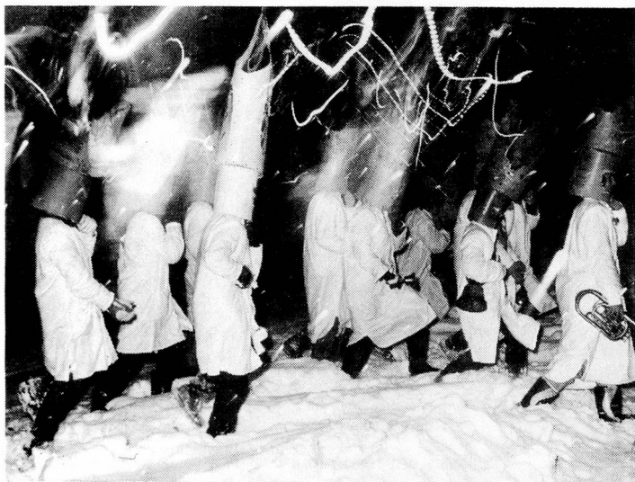
Below: The shining St. Nicholases of Wollishofen.