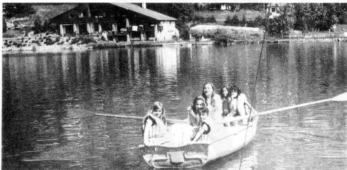
Swiss schools provide an opportunity for tourism

provide a general education along with vocational training.