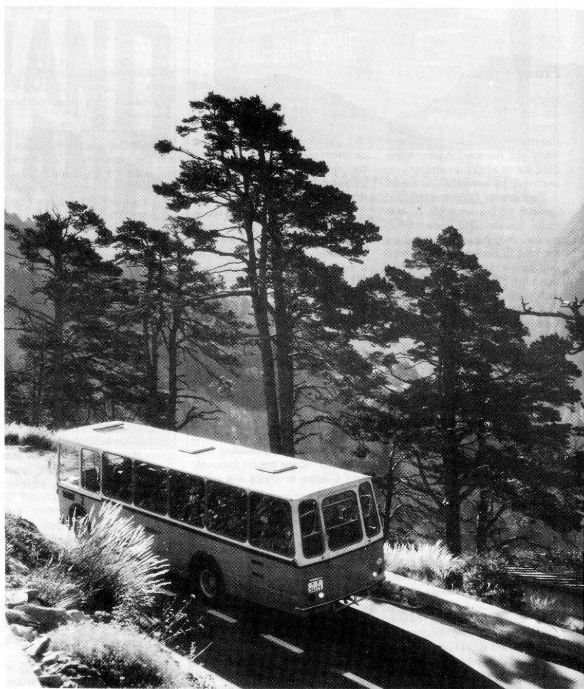
A Swiss postal coach today – and as they used to

Details from Appenzell Tourist Office, 9043 Trogen, Switzerland.