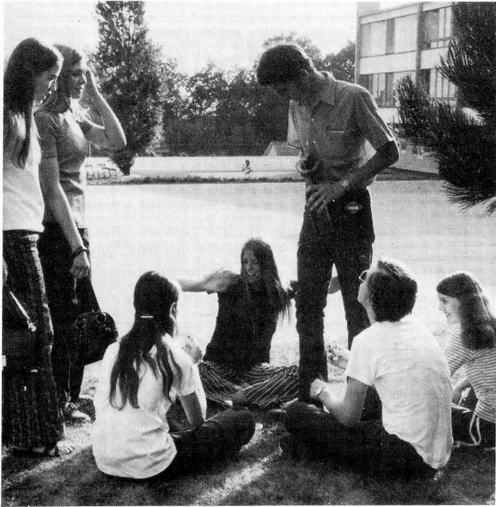
By talking and playing together, young people of different nationalities get to know each other – a break between lessons on one of the Swiss holiday courses.