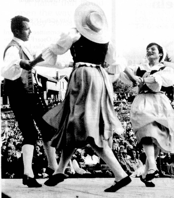
Folk dancers abound. These are from Geneva