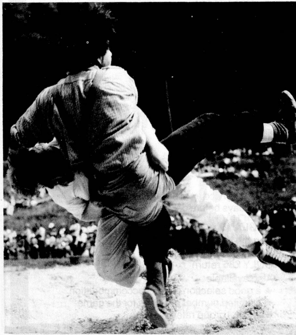
Getting to grips in the "Hosedupf"