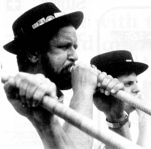
Alphorn players add to the atmosphere