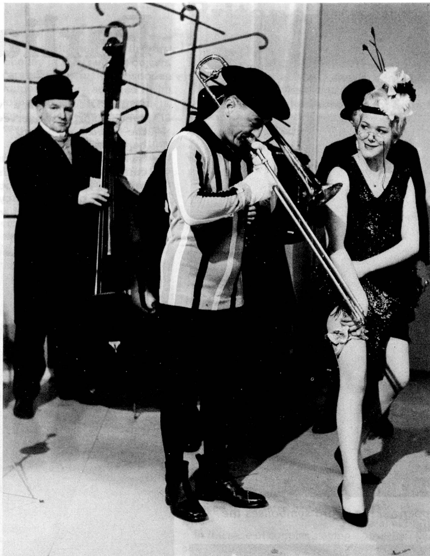
The winner of the first Golden Rose of Montreux in 1961 – the BBC's Black and White Minstrel Show

"Then came colour and the evolution in electronics. Now