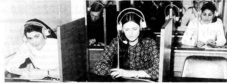
Learning foreign languages can be fun

International School of Geneva Ecole Internationale de Geneve 62 route de Chêne, 1208 Geneve Tel: 36 71 30 international education in a Swiss environment Maturité Fédérale Suisse International Baccalaureat . Baccalaureat Français GCE . American College Boards Boarders from age 11 winter and summer sports, university guidance