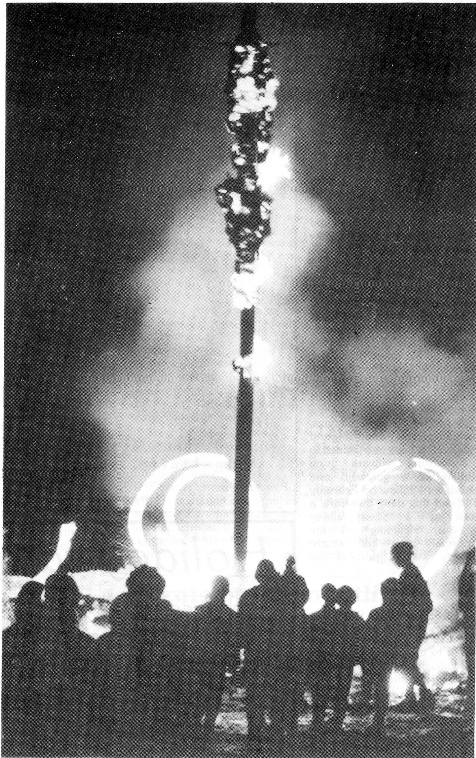
With the whole village participating, the "hom strom" or straw man is burned