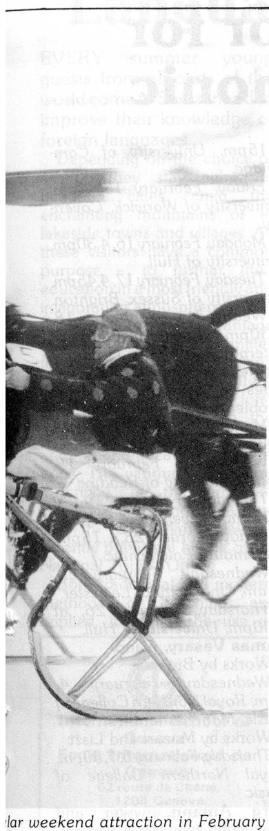
lar weekend attraction in February