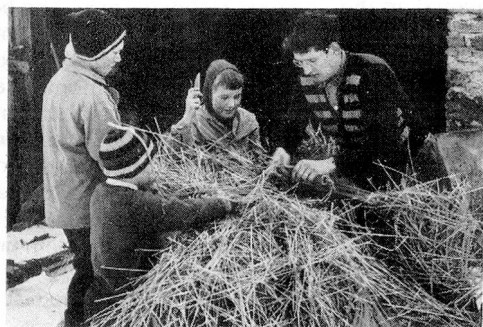
Gathering straw from the farms

The "hom strom" is then burnt to the accompaniment of folk songs, followed attentively by guests from far and near as night falls. And with that the winter is banished – at any rate symbolically – though winter sports can still be enjoyed in the mountains of Switzerland for weeks to come, even if the full rigours gradually begin to relax.