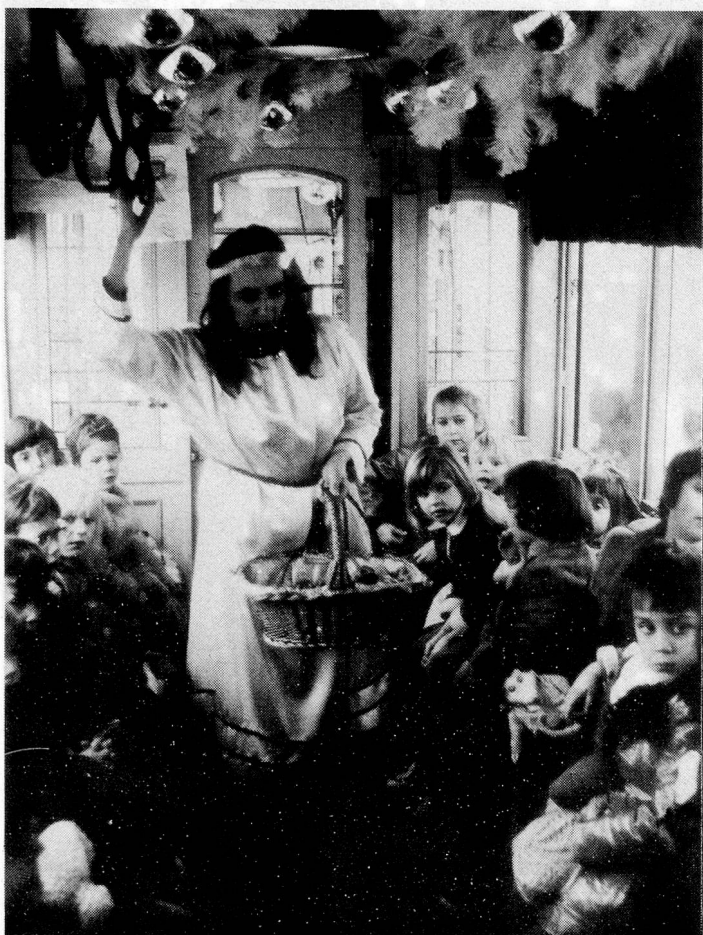
The Christmas Fairy offers "Willisauerringli"

The dual aspect of the custom comes particularly to the fore in Central Switzerland, where it has become traditional to mark the period before Christmas with big, noisy processions.