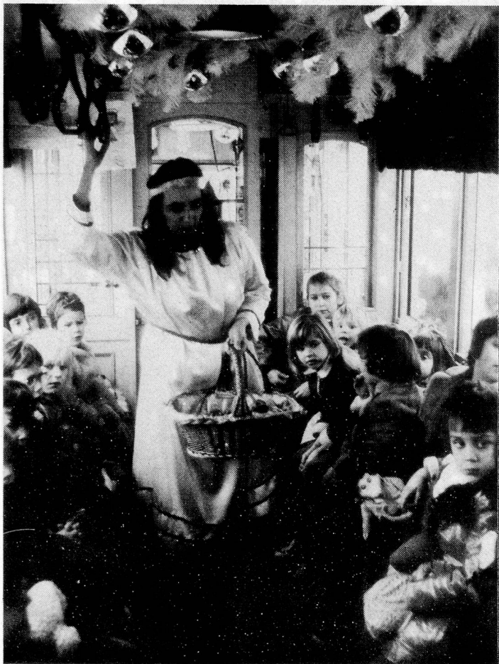
The Christmas Fairy offers "Willisauerringli"

The dual aspect of the custom comes particularly to the fore in Central Switzerland, where it has become traditional to mark the period before Christmas with big, noisy processions.