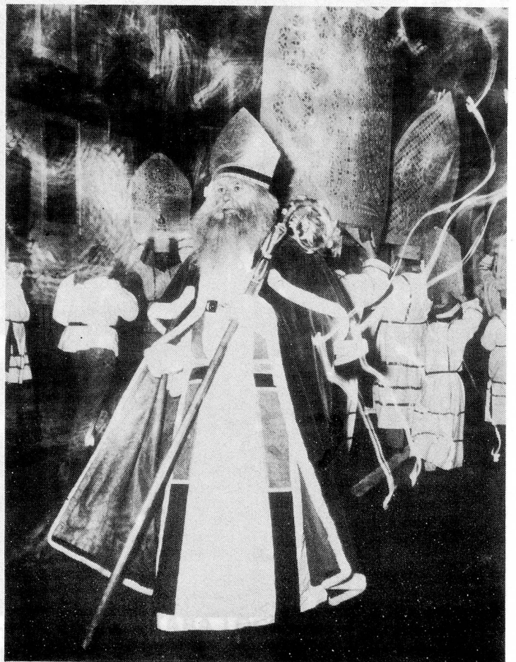
Colourful dancers accompany St. Nicholas