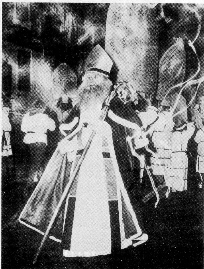
Colourful dancers accompany St. Nicholas