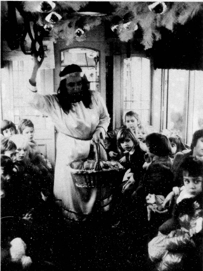
The Christmas Fairy offers "Willisauerringli"

The dual aspect of the custom comes particularly to the fore in Central Switzerland, where it has become traditional to mark the period before Christmas with big, noisy processions.