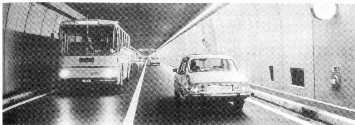
Inside the Gotthard road tunnel . . . speedy, safe and free from tolls.

removed, shifted 130 metres at a cost of Sfr. 300,000. It is now to be found at the northern entrance of the tunnel.