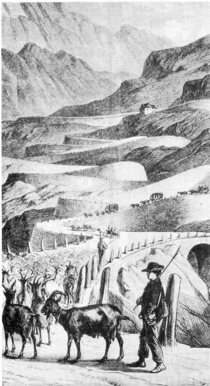
The long winding road over, from a period print. And, below, an etching showing the old Devil's Bridge.