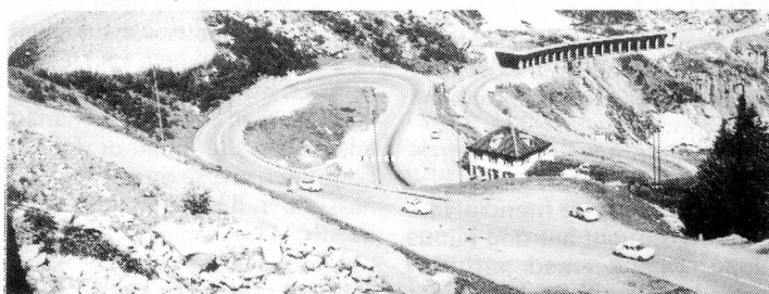
On through the Reuss valley goes the winding pass road.