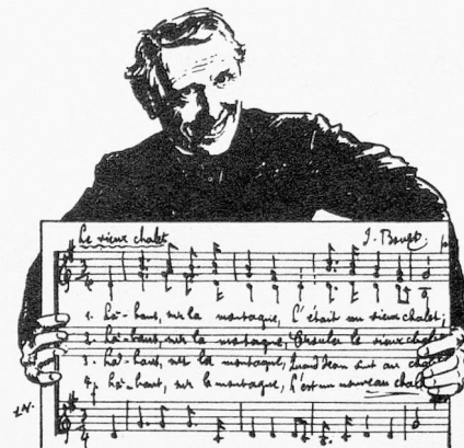
Abbé Joseph Bovet 1879-1951

Saturday, 23rd and Sunday, 24th August: Day of the Fribourgeois from inside Switzerland and abroad at «Grün 80», Swiss exhibition on horticulture and landscaping, covering 46 ha.