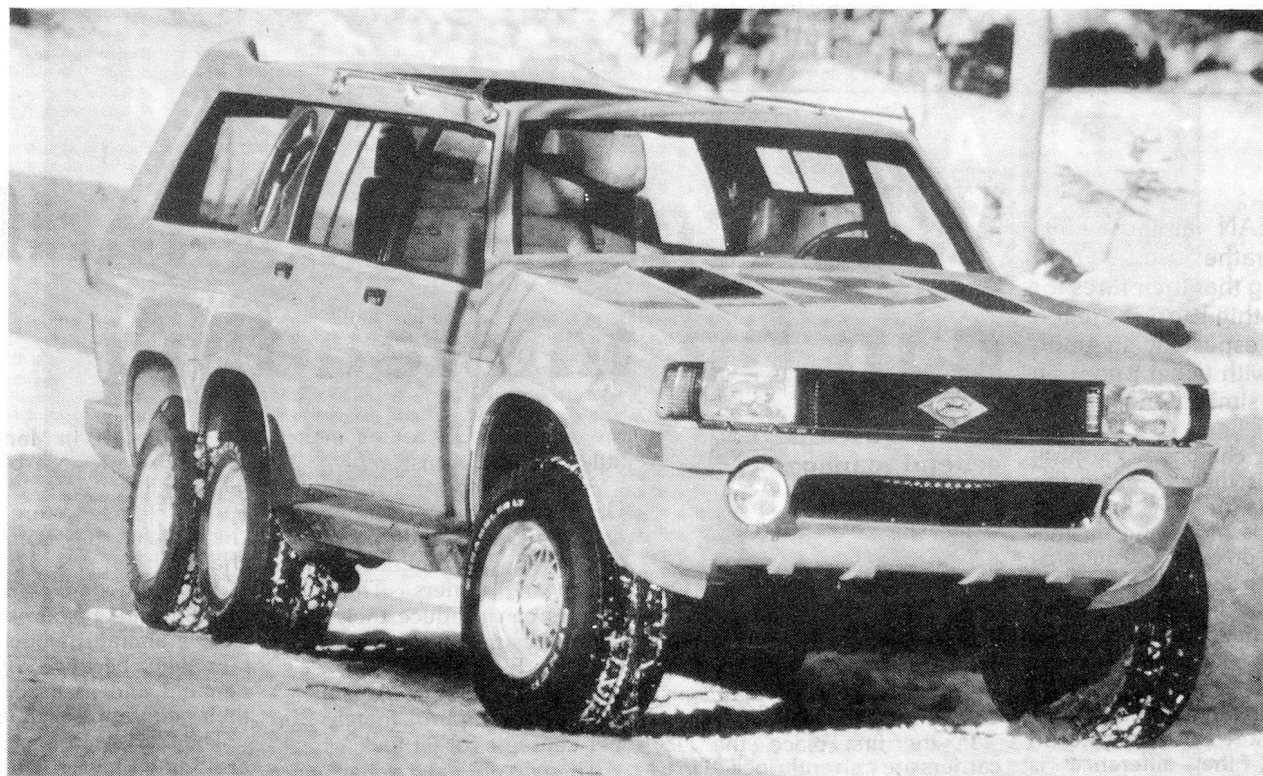
King Khaled's Windhawk complete with royal crest