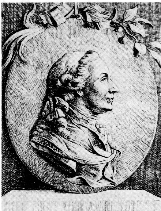
George Michael Moser (1704-1783)