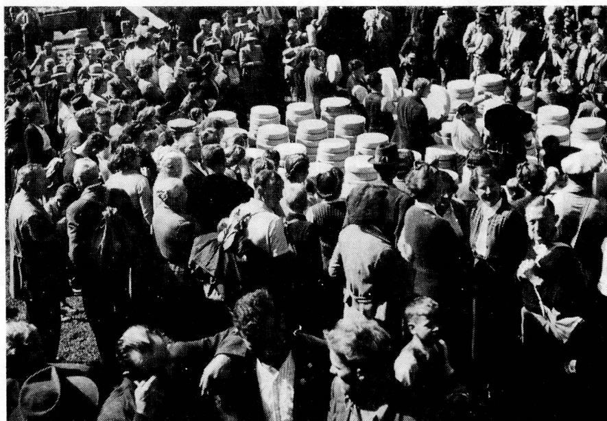
Celebrating Käseteilet in the Justis valley

A small festival is held, and then the alpine folk make their way down to the valley, followed by the cattle. The cow with the best yield from each alp is specially spruced up and decorated.