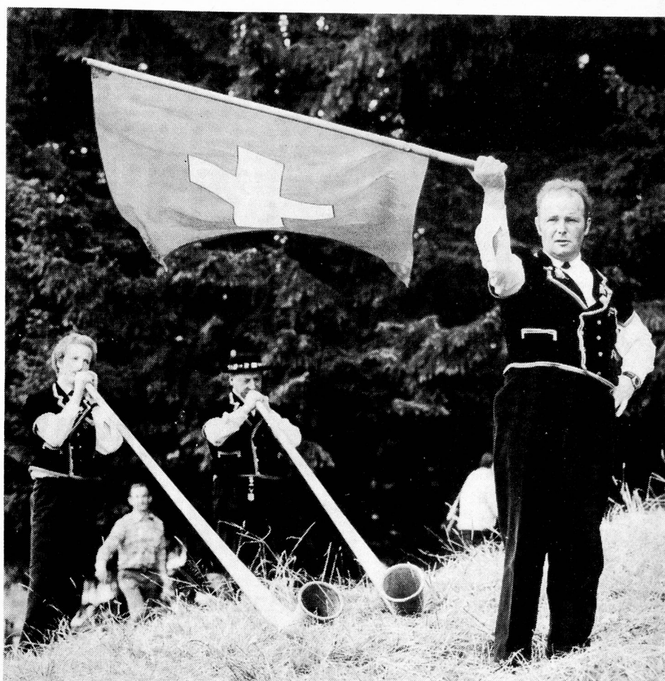
The flags fly high on August 1

But this situation — which compares very favourably with other European countries and the rest of the world — should not be allowed to lull us into a false sense of security. This seemingly sunny picture is not without its shadows.