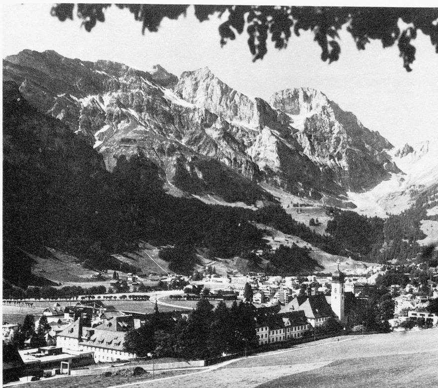
The Benedictine Abbey of Engelberg, founded in 1120 (Photo ONST).