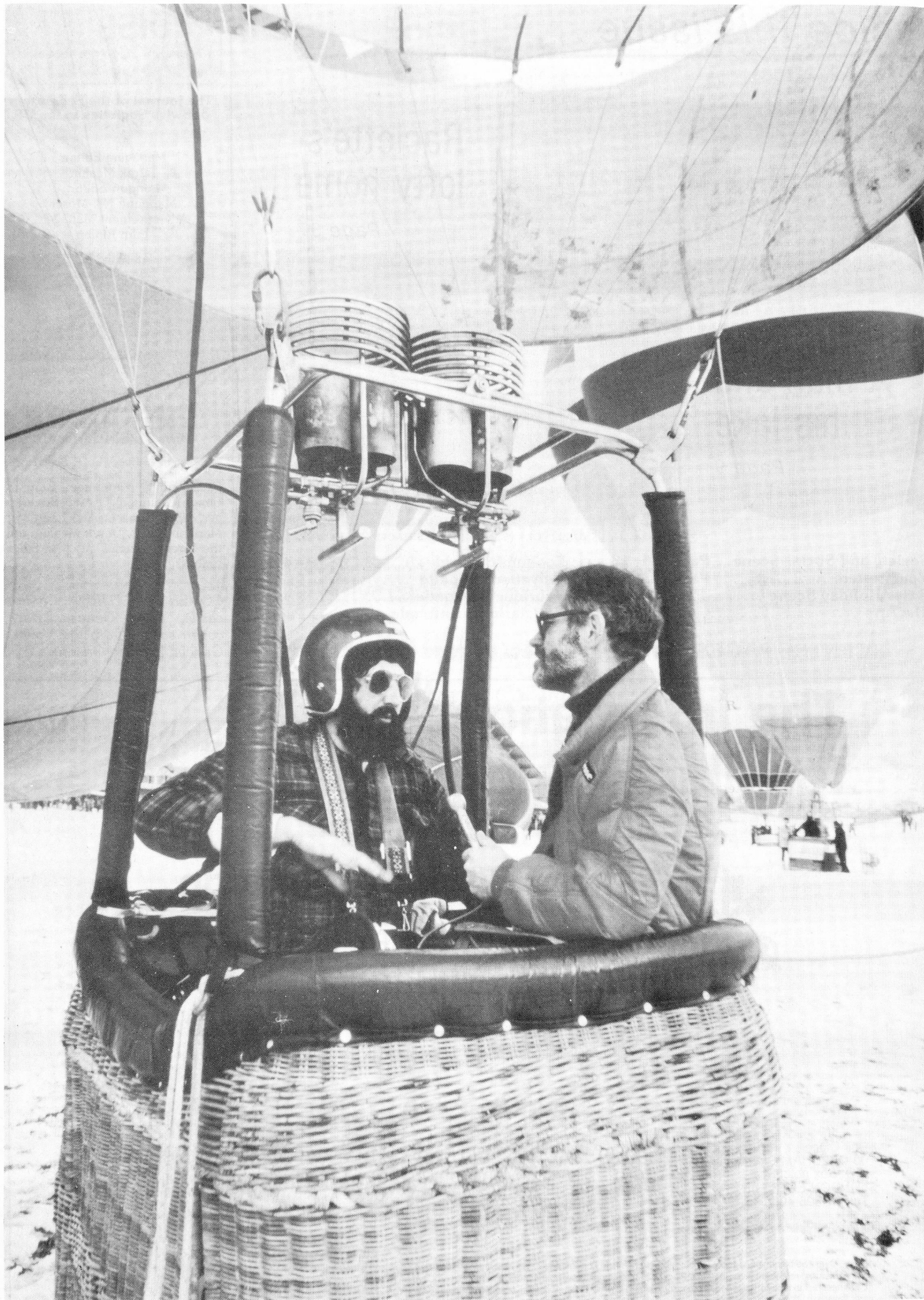
Swiss Radio International in action