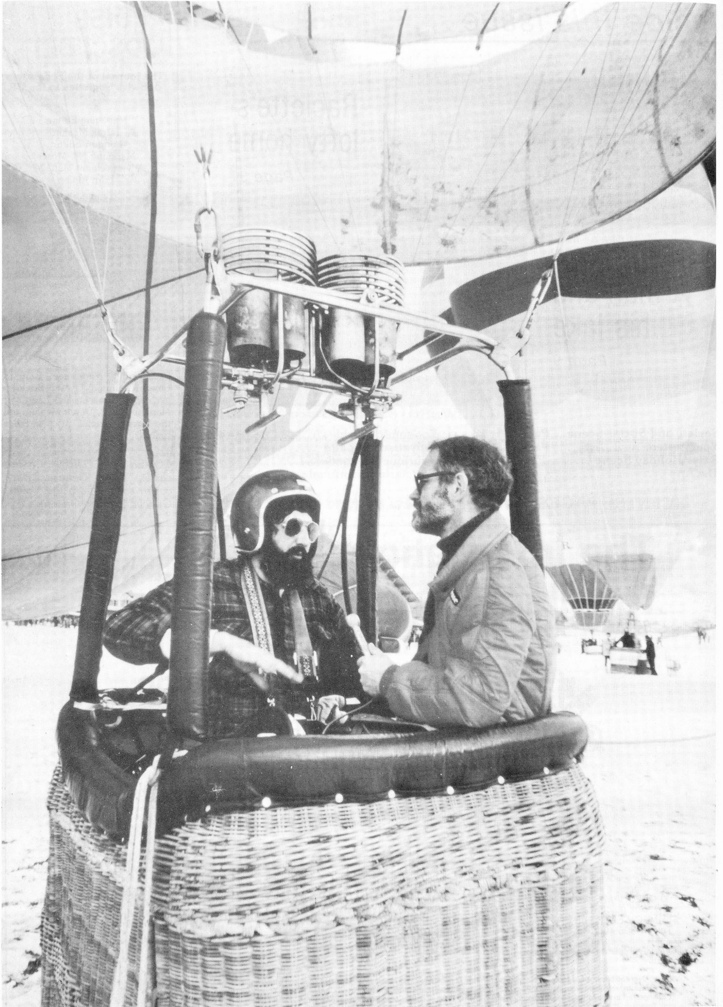
Swiss Radio International in action