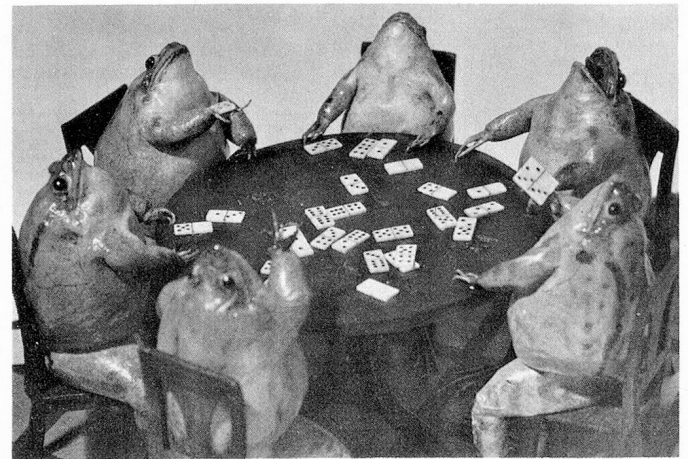
The Swiss Middle Ages town of Estavayer-le-Lac is the home of this strange, world exclusive spectacle of frogs attending school or enjoying a spaghetti supper, or playing dominoes.