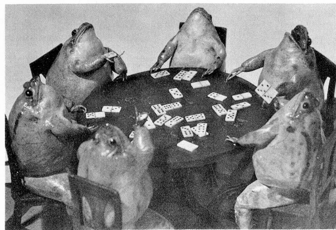
The Swiss Middle Ages town of Estavayer-le-Lac is the home of this strange, world exclusive spectacle of frogs attending school or enjoying a spaghetti supper, or playing dominoes.