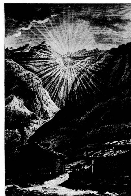
The village of Elm in the Canton of Glarus.

However industrious the Glarus people may be – they call it « gwerbig und gwirbig » – they do not neglect the sense of the beautiful, the fine and the everlasting. Splendid churches adorn several villages such as Betschwanden, Elm and Obstalden. The world-renowned architect, Johann Ulrich Grubenmann, built the churches of Muehlehorn, Mollis, Mitloedi and Schwanden. The parish church of Naefels is a stately edifice from the Late Baroque period, and there are signs of Baroque also in the Evangelical church at Netstal. The centre of Glarus was destroyed by fire in 1861, the largest conflagration in Swiss history; an architect from