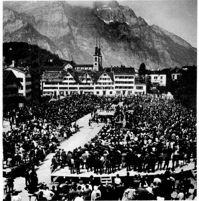
«Landsgemeinde» in Glarus, capital of the Canton, on the first Sunday in May.

pletely. Their singing mountain dialect is one of the most original idioms in Switzerland. It has kept many forms of the Mittelhochdeutsch . Thus in Glarnertütsch one says: « De neu Buu staht fry », and not as in the Pre-Alps and the Midlands: « De neu Bau staht frey ». The Glarus idiom is also the official language as it is accepted in the Landrat as well as at the Landsgemeinde , the open-air parliament. The dialect poetry and prose, too, deserve to be seen or rather heard.