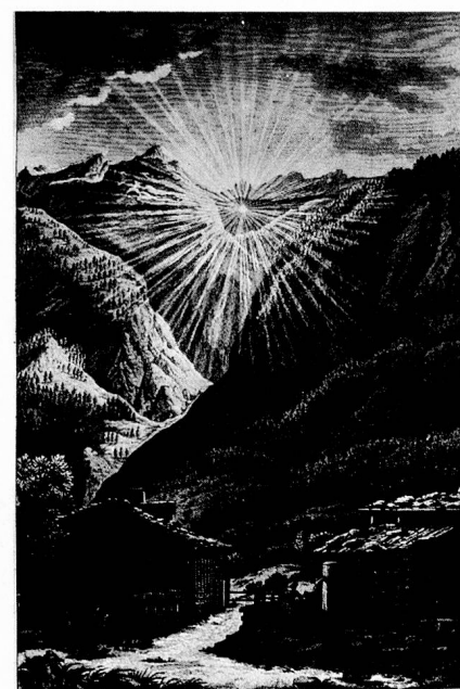
MARTIN-LOCH, TROU S. MARTIN. Village naturel dans un Riedel pour le soleil, en hiver et en septembre le Chêne de l'Église d'Elm au Canton de Glarus.

However industrious the Glarus people may be – they call it « gwerbig und gwirbig » – they do not neglect the sense of the beautiful, the fine and the everlasting. Splendid churches adorn several villages such as Betschwanden, Elm and Obstalden. The world-renowned architect, Johann Ulrich Grubenmann, built the churches of Muehlehorn, Mollis, Mitloedi and Schwanden. The parish church of Naefels is a stately edifice from the Late Baroque period, and there are signs of Baroque also in the Evangelical church at Netstal. The centre of Glarus was destroyed by fire in 1861, the largest conflagration in Swiss history; an architect from