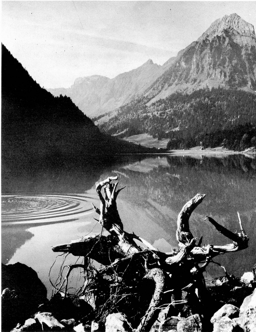
In Obersee (1000 m.o.s.) over Näfels. Behind left the Brünnelistock.

lery and the Natural History Collection house great treasures, and the Museum of the Land of Glarus in the Freuler Palace at Naefels, where alpine farming and colour printing have their special rooms, well holds its own when compared with other collections of similar size. Poetry, especially in Glarus dialect, is impressive and characteristic of the people. The rank of scientists of Glarus families is large, and they work at institutes and universities. In the Canton