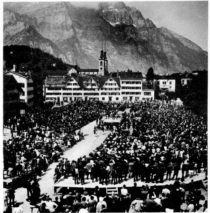
«Landsgemeinde» in Glarus, capital of the Canton, on the first Sunday in May.

pletely. Their singing mountain dialect is one of the most original idioms in Switzerland. It has kept many forms of the Mittelhochdeutsch . Thus in Glarnertütsch one says: « De neu Buu staht fry », and not as in the Pre-Alps and the Midlands: « De neu Bau staht frey ». The Glarus idiom is also the official language as it is accepted in the Landrat as well as at the Landsgemeinde , the open-air parliament. The dialect poetry and prose, too, deserve to be seen or rather heard.