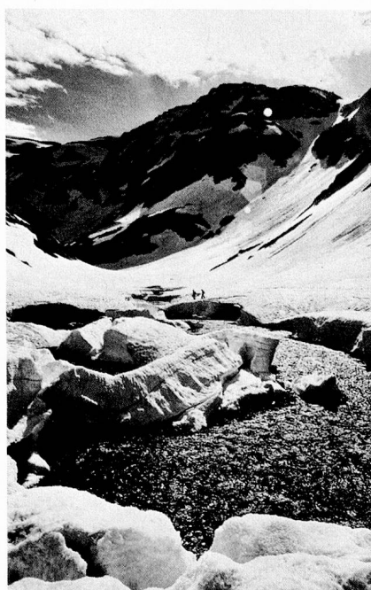
The road from Elm to the Panix Pass along the Lake of Haexen.

The Glarus textile industry reached its fullest development with the cotton printing works founded in 1740. By 1864 they employed no fewer than 6250 people at 4200 printing tables. And it was in exactly that year that, thanks to the devoted endeavour of a doctor, Fridolin Schuler, the Glarner Landsgemeinde accepted the first law in Europe on the protection of the workers. Ethical working principles and a sense of adventure made the Valley of the Linth to one of the richest alpine valleys. Ever new products were put on the market, such as electrical apparatuses of the «Therma» concern, asbestos machines and products made from synthetic materials. At