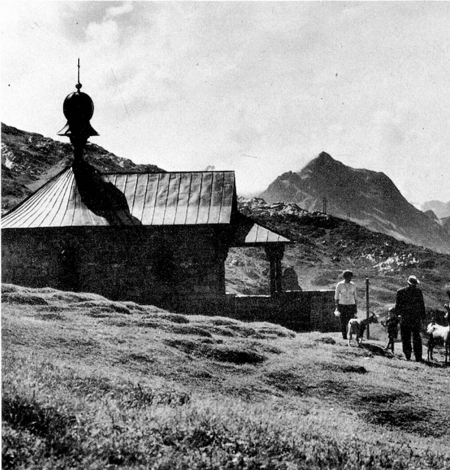
The Klausen Pass which connects the Cantons of Uri and Glarus.