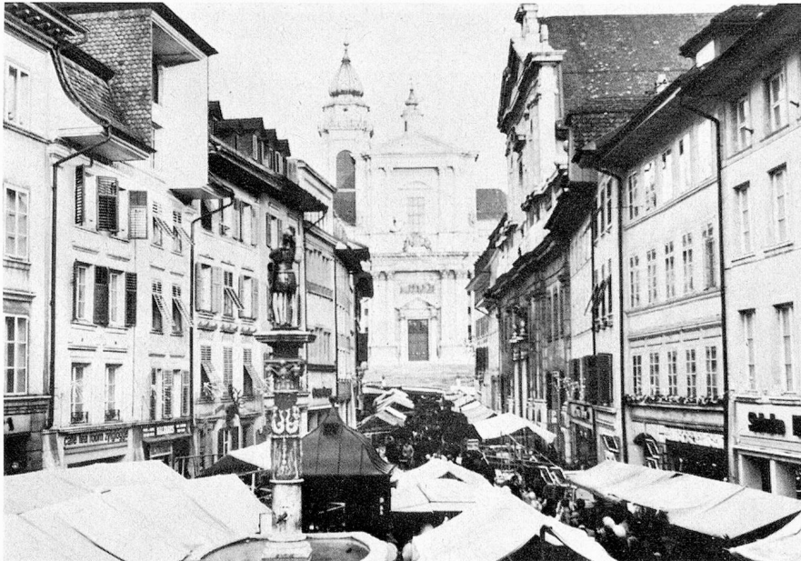
Restaurated Market place of Solothurn.

the original materials are still available in Switzerland or in neighbouring countries, but they are often appreciably dearer than comparable modern materials or take longer to prepare, which adds to the cost.