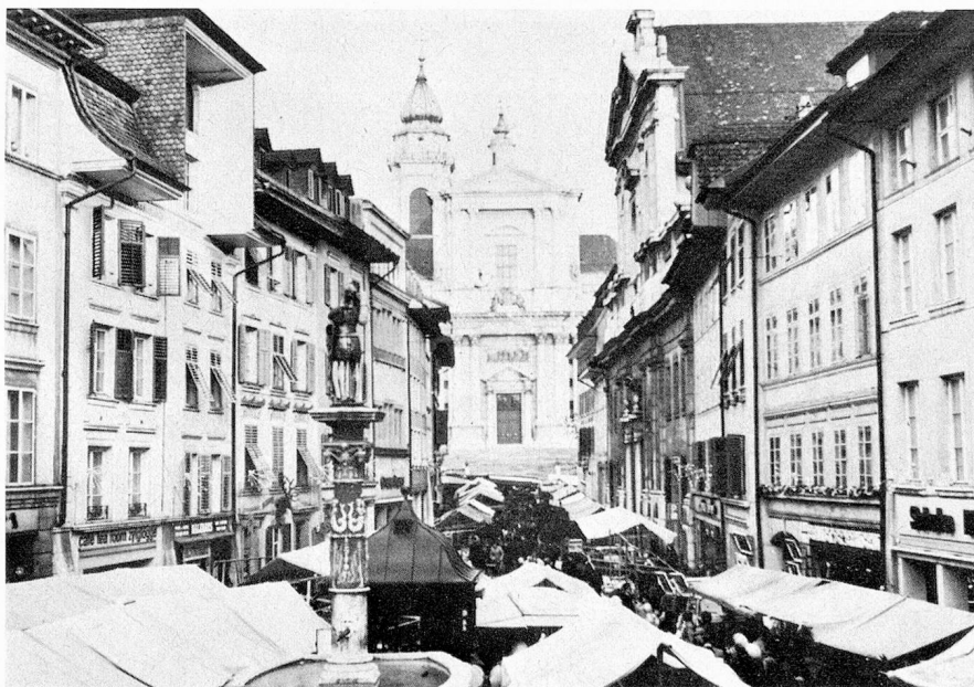
Restaurated Market place of Solothurn.

the original materials are still available in Switzerland or in neighbouring countries, but they are often appreciably dearer than comparable modern materials or take longer to prepare, which adds to the cost.