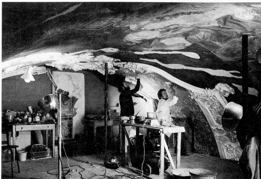
Experts working in the Abbatial of Einsiedeln (SZ)

These are scientific schedules rather than critical assessments, so most cantons are also preparing detailed site inventories which will proceed from an individual study and evaluation of all pre-1920 buildings still in existence to an indication of the special characteristics and importance of architectural complexes and finally of whole sites. As most of these inventories will not be completed for several years, the Confederation decided in 1973 to set up an Inventory of Sites in Switzerland deserving Protection , which is based on the site as a unity and, taking account of the surroundings and views, lays down pro-