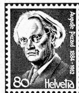
Auguste Piccard 1884-1962 Physiker Physicien Fisico