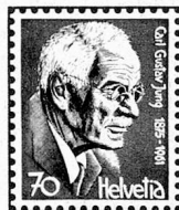
Carl Gustav Jung 1875-1961 Psychologe Psychologue Psicologo