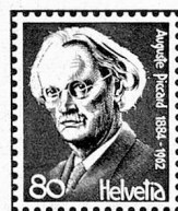
Auguste Piccard 1884-1962 Physiker Physicien Fisico