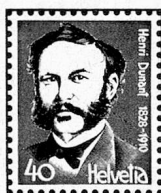
Henri Dunant 1828-1910 Philanthrop Philanthrope Filantropo