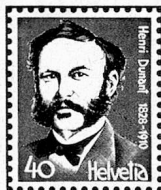
Henri Dunant 1828-1910 Philanthrop Philanthrope Filantropo