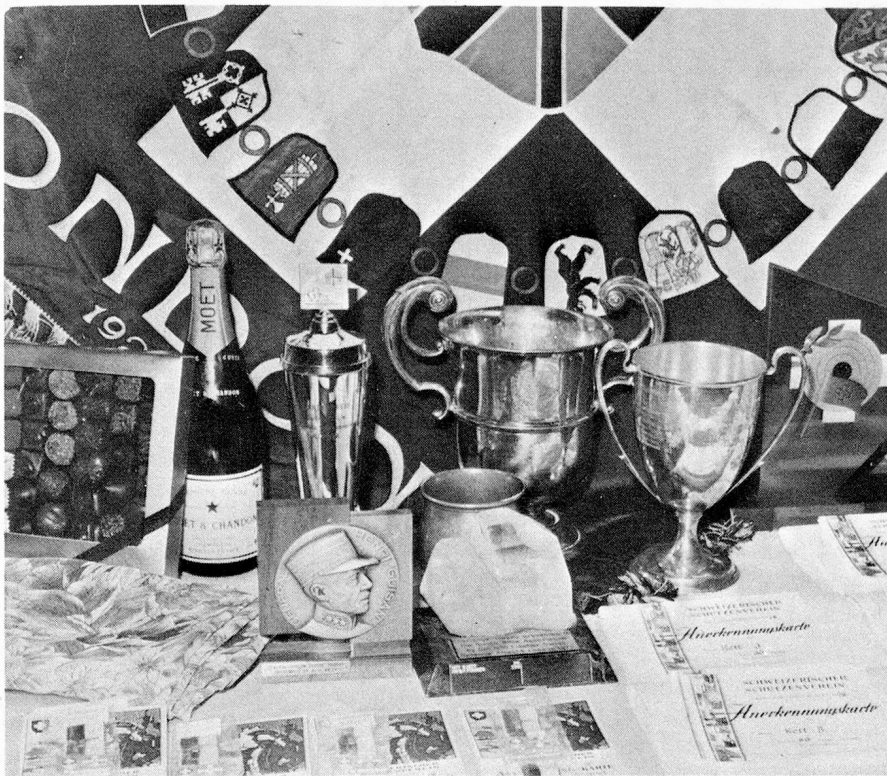
No wonder competition is so keen when cups, trophies, and other goodies like these are at stake!