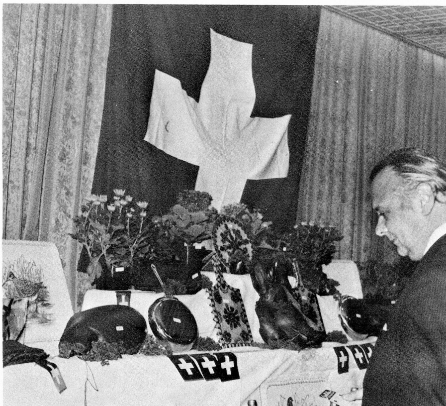
The prizes on the tombola stand understandably attracted considerable attention.

An impressive Tombola table with juicy pieces of a smoked ham, flowers, drinks and other tempting prizes invited everybody to take part and support the club's finances with their contributions for tickets. The waiters were quite busy cleaning away all the empty envelopes and messages of "mercy".