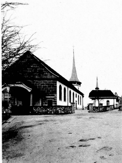
In Tavel (FR), the basically Gothic parish church and the ossuary have been restored