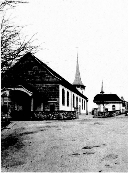
In Tavel (FR), the basically Gothic parish church and the ossuary have been restored