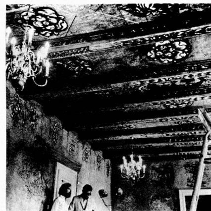
... and after exploratory excavations

federal authorities. Moreover, the public must be granted a specified measure of access to the monument. At present approximately 2000 buildings are under federal protection.