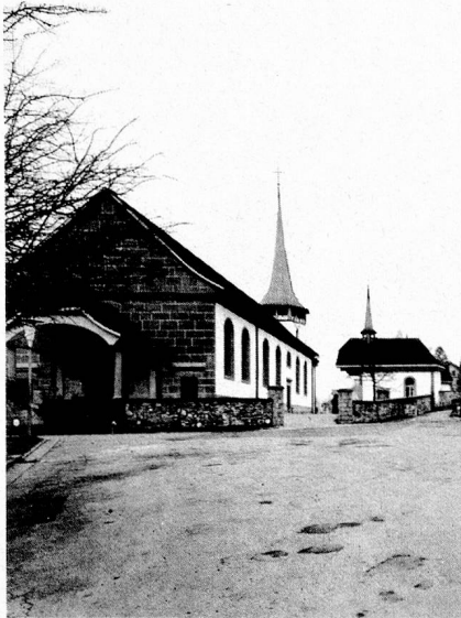
In Tavel (FR), the basically Gothic parish church and the ossuary have been restored