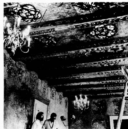
... and after exploratory excavations

The Confederation promulgated the Act concerning the Protection of Nature and the Landscape in 1966 on the strength of Article 24 sexies of the Federal Constitution, approved by the people and the cantons in 1962. This had enshrined in the Constitution the Confederation's responsibility for protecting monuments, which had