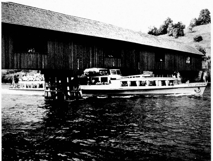
Covered wooden bridge going over the river Rhine