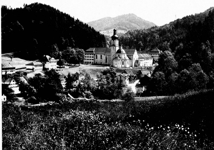
The former Benedictine abbey in Fischingen

Untersee for all parts of the world. Amongst the more important industries of the Thur Valley are mills, cardboard, machine and metal ware factories, and a world-wide undertaking which produces emery and abrasive products. The Hinterthurgau in the South, too, has been industrialized more intensively: fairly large concerns in the textile and furniture industries, factories producing kitchen equipment and sunblinds, as well as chemical works are established there. What a colourful variety! In the service sector (banks, insurance, education, hospitals, administration), only 30% of all wage-earners in the Canton are employed, 14% fewer than the Swiss average. The large service industries are concentrated in the neighbouring centres of Zurich, Winterthur, St. Gall, Constance and Schaffhausen. That may be the reason why the average income per head of the Thurgau population lies somewhat below the Swiss average.