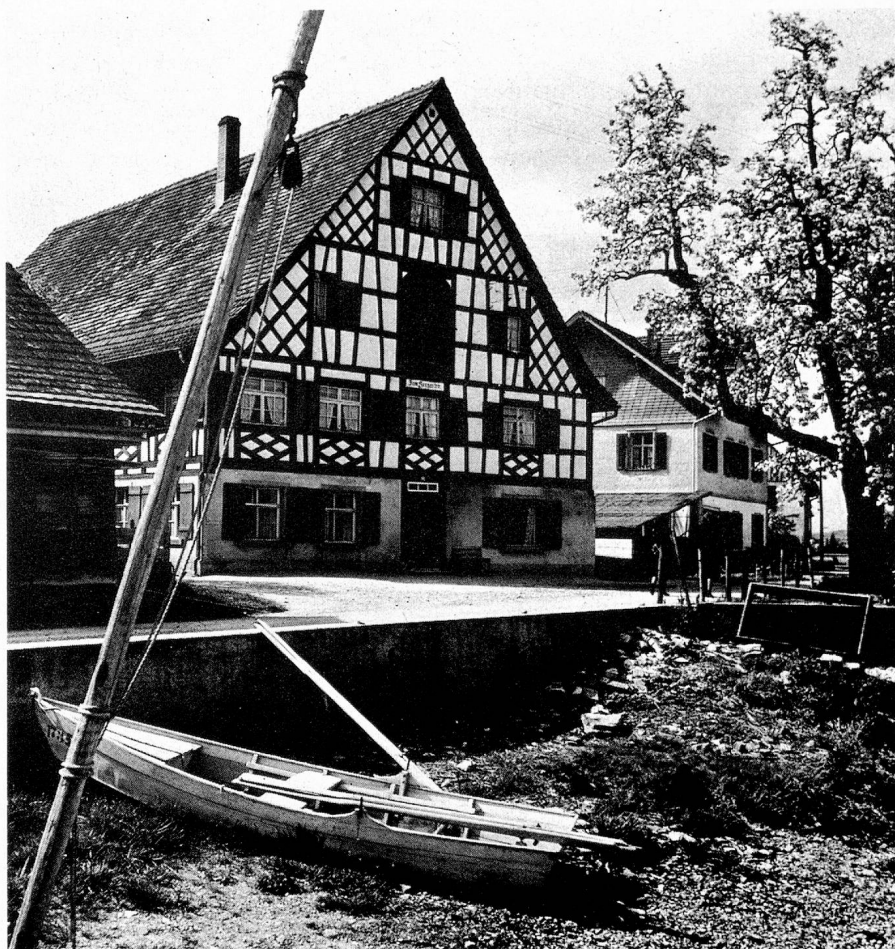
Home with typical frame and fill work architecture in Ermatingen

Already 2800 B.C., the first men settled in this part. The marsh settlements of the neolithic age at Egelsee near Niederwil and Breitenloo to the West of Pfyn belonged to the Pfyn Culture. These people of neolithic times, who were tillers and cattle breeders, were followed in turn by immigrants of various kinds, as the string potters in about 1800 B.C., traders from the South in the Bronze Age, and the Celts in the Hallstatt period. And then, the sparsely populated country on the Lake of Constance belonged to the Roman Empire for over 400 years: brick-making, masonry, fruit- and wine-growing were introduced; generously constructed trade and military routes connected places like Arbor felix (Arbon), Ad fines (Pfyn) and Tasgaetium (Eschenz) with the Midland network. Roman soldiers settled in the forts. Later, the Alemans immigrated and penetrated the area; they gave the country their language, their style of living and building. The Franconian «Gau» organisation knew a Thurgau for the first time; at the beginning, it comprised a quarter of Switzerland, known as the Pagus Durgaugensis according to a St. Gall document of 744. From the earldom as geographical term evolved a judiciary and administrative district. The earldom titles were vested in the House of Kyburg, and from 1264 onward with their heirs, the Habsburgs. The political unity of the Thurgau is owed to their strict leadership. In 1460, the strong and mighty Confederates incorporated the