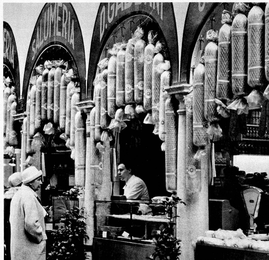
This sausage shop imparts a distinctly "southern" ambience.

The very word Lugano conjures up a serene blue lake, gorgeous sunshine and an azure sky. Well, like anywhere else the weather cannot be guaranteed. We recently spent a week there, and although we did get two really beautiful days, the rest of the time was rainy, dull and grey. Yet the holiday was an unqualified success.