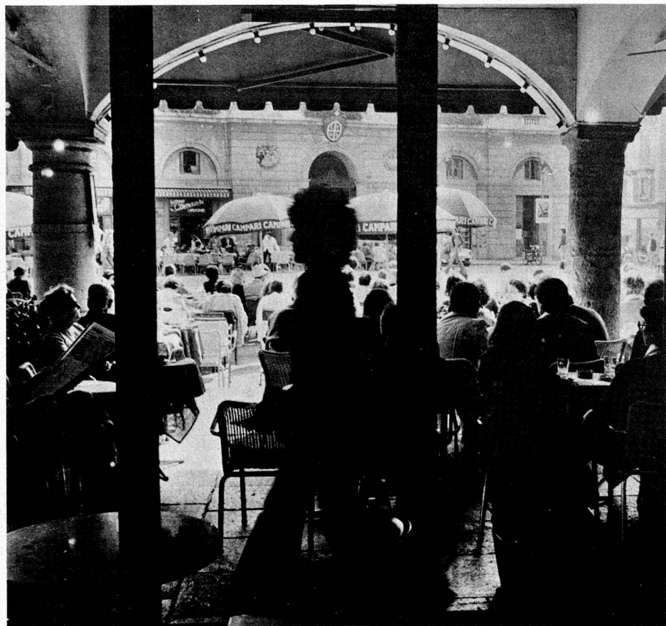
A popular meeting place for holidaymakers and local people—the cafe's on Lugano's Piazza Priforma.