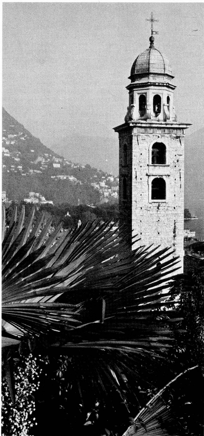
Lugano, famous for its sub-tropical vegetation, has a wealth of places of cultural interest such as San Lorenzo Cathedral pictured here. In the background is Monte Bre, easily reached by funicular railway.