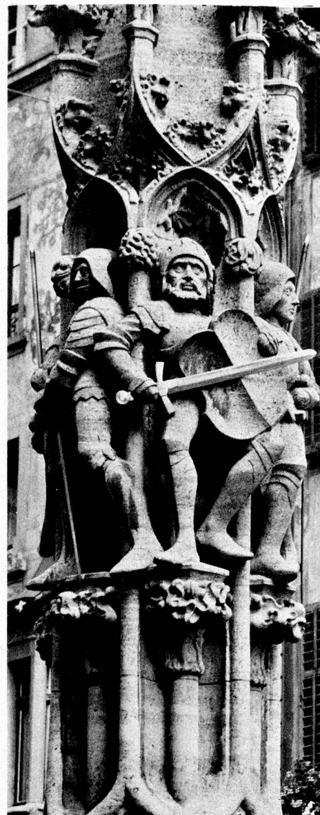
A fragment showing six marching armed warriors from Lucerne's 15th century wine market.

Lucerne is a long ribbon of a town sandwiched between lake, river and the rising hills behind it. When the "foehn" wind comes, the city is transformed, putting on its picture postcard face. But when the strange, warm south wind fades, heavy clouds gather and the lake turns grey.