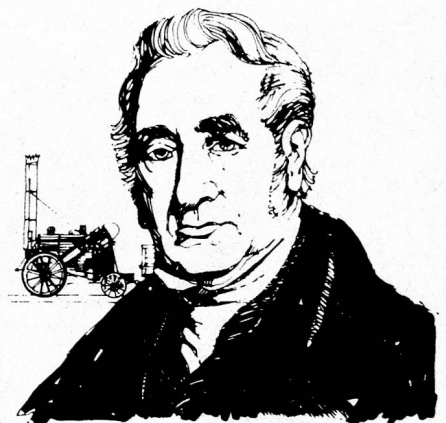
GEORGE STEPHENSON, 1781-1848. English inventor and engineer.

Foundry Chemicals Division, a subsidiary of Plastics Division, is a leading supplier of specialised chemicals for the foundry industry. The products include resins, silicates, hardeners, acid catalysts, conventional oil sand binders, facing materials and foundry paints.