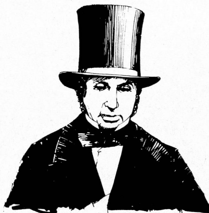
ISAMBARD KINGDOM BRUNEL, 1806-1859. English civil engineer.

Ciba-Geigy's Plastics Division is Britain's largest manufacturer of synthetic resin adhesives. Aerolite® urea resins, long established as outstanding wood glues, find their biggest use in the manufacture of chipboard and plywood, for veneering and all types of joinery.