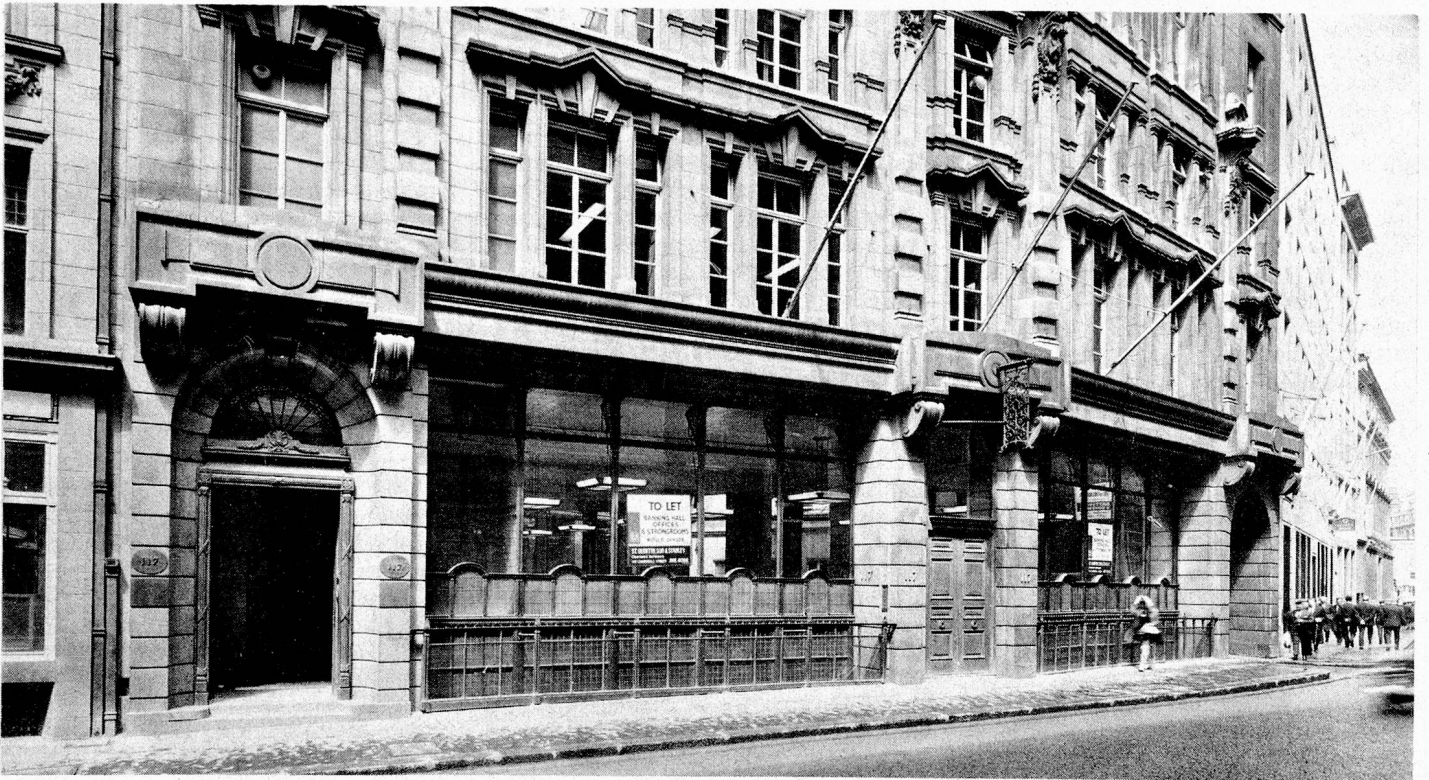
The original Old Broad Street premises.