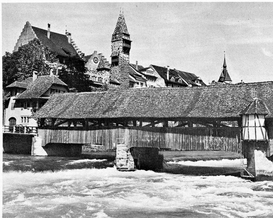
The covered wooden bridge across the Rhine at Bremgarten.

It would seem that Switzerland is alone amidst her neighbours in having such a number of covered wooden bridges. Practically non-existent in France and Southern Germany they are sometimes found in Austria and Northern Italy but not in the same quantity or use as in the Central Swiss Cantons where they remain as a delightful and artistic reminder of a bygone age.