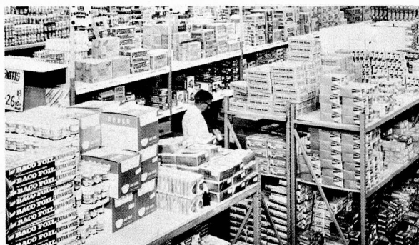
Series 70 MEDIUM DUTY 8,000 lbs. PER FRAME Racking for non-palletised merchandise. Clear spans up to 8 ft.

Acrowracks can be installed or adjusted to suit changing requirements quickly and at low cost. Find out more about them, telephone your nearest Acrow Branch Office today.