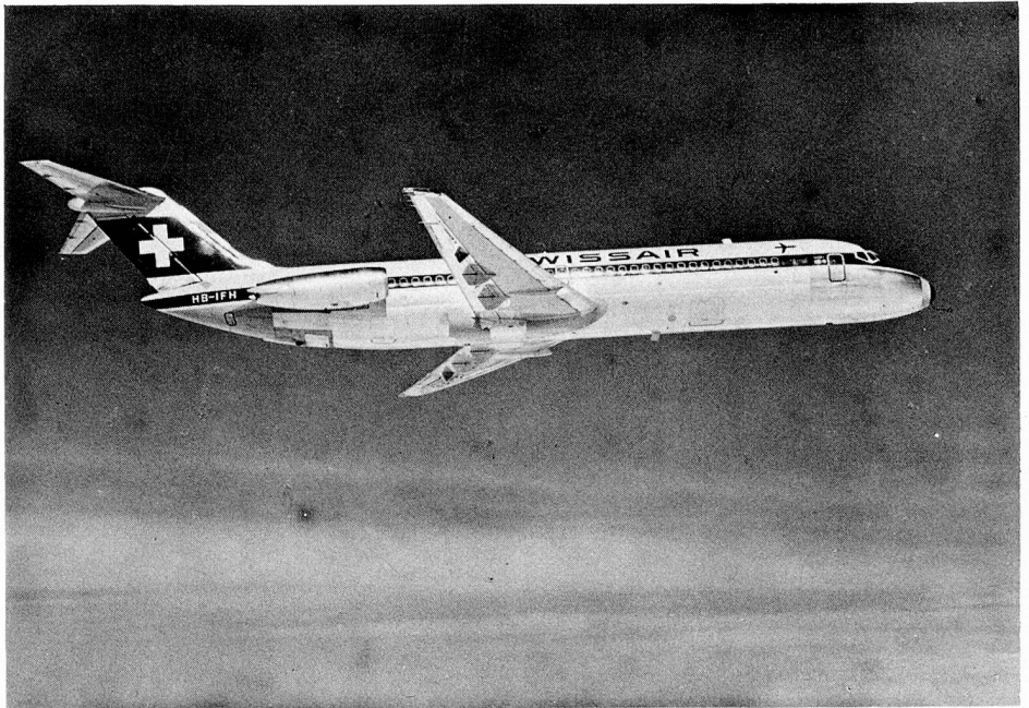
A Swissair DC-9-32 similar to that which is being sold to Texas International Airlines.

In the Swiss balance of revenues for 1975, Swiss tourism thus once again comes third for net receipts, after revenue from capital (5.15 billion) and "other services" (2.95 billion) — a heading that covers licence fees, the expenditure of international organizations, bank commissions, etc. On the European level, her gross tourist receipts of 5.38 billion francs place Switzerland in 7th position.