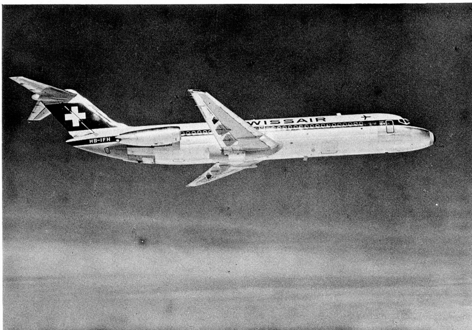
A Swissair DC-9-32 similar to that which is being sold to Texas International Airlines.

In the Swiss balance of revenues for 1975, Swiss tourism thus once again comes third for net receipts, after revenue from capital (5.15 billion) and "other services" (2.95 billion) — a heading that covers licence fees, the expenditure of international organizations, bank commissions, etc. On the European level, her gross tourist receipts of 5.38 billion francs place Switzerland in 7th position.