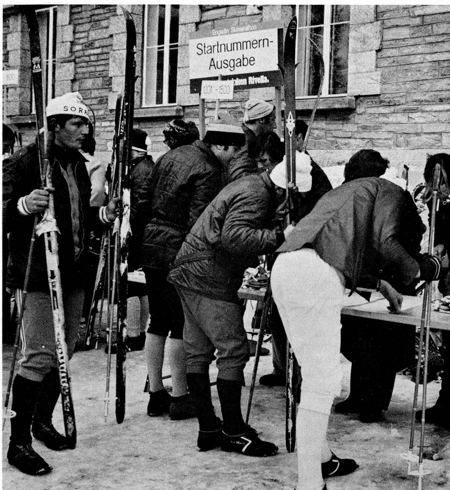
The marathon contestants report to collect their starting numbers.

Langlauf- und Skiwanderschule St. Moritz 7500 St. Moritz/Switzerland Tel: (082) 3 62 33