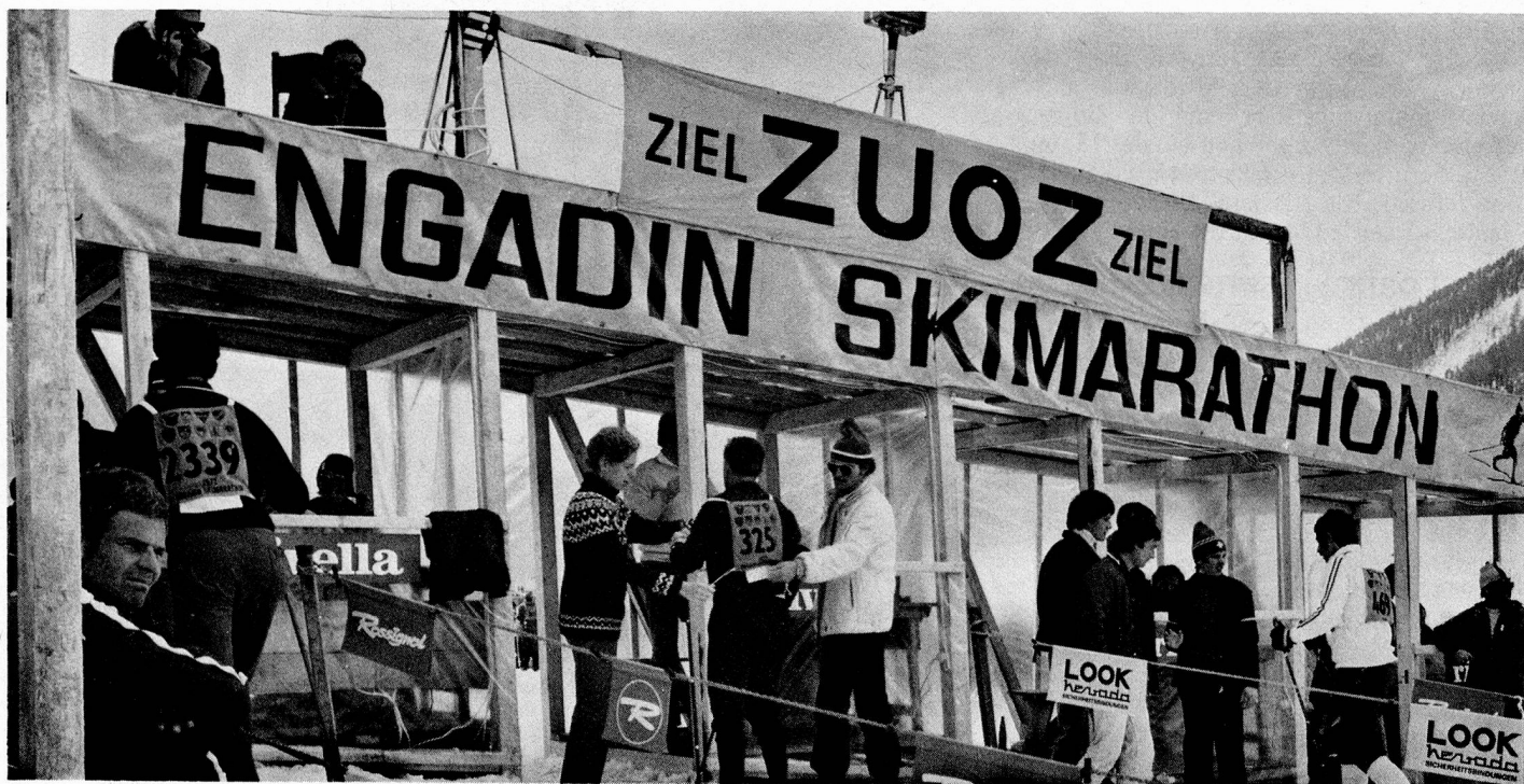
Most marathon participants ski for more than three hours before they cross the finishing line.