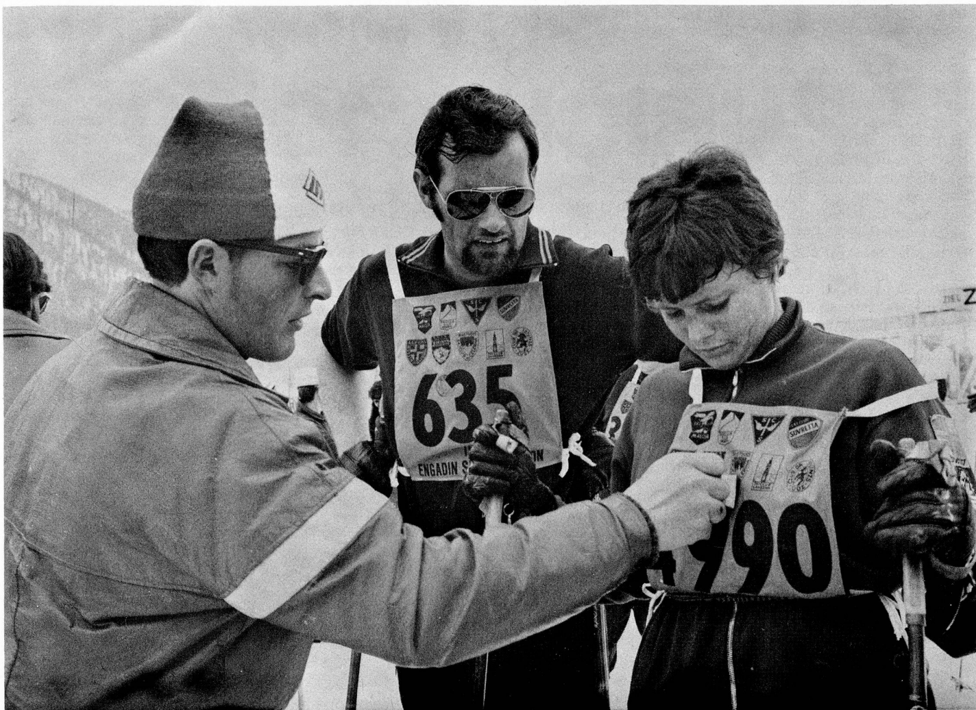
This is what makes it all worth while. The words "Finished the course" are stamped on to the starting numbers — a perfect souvenir for the living-room wall.